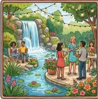
Waterfall Garden Party

These items are available for online bidding only. Bidding for these items will close at 9:00 p.m. on Friday, June 5 and will not continue during the event, so you do not need to attend in person to participate or win.