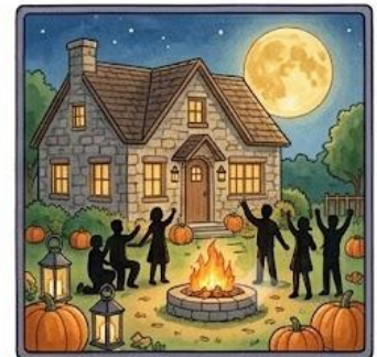
Harvest Moon Celebration at Stone Crop Cottage