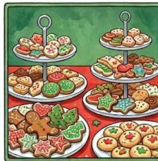
6 Dozen Christmas Cookies