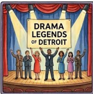
Drama Legends of Detroit