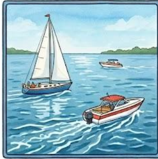
A Day on The Lake Saint Clair