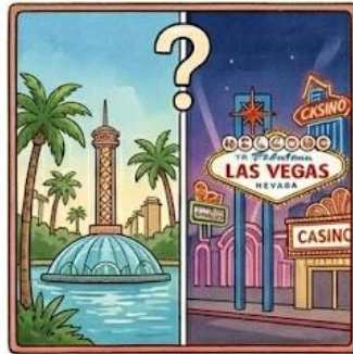
Orlando or Vegas? Choose Your Getaway!