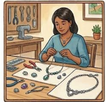
Custom Necklace Making