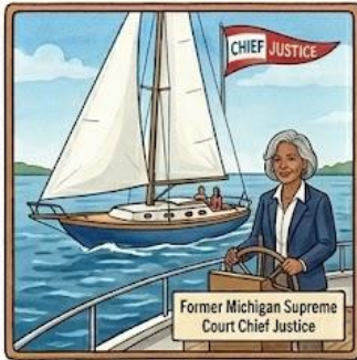
Sailboat ride on Lake St Clair