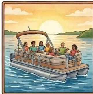
Afternoon Boat Cruise on Lake Orion