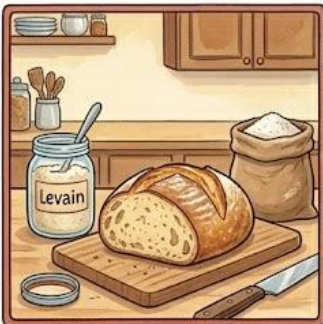
Home Baked Organic Sourdough Bread