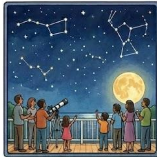
A Night With and Under the Stars!