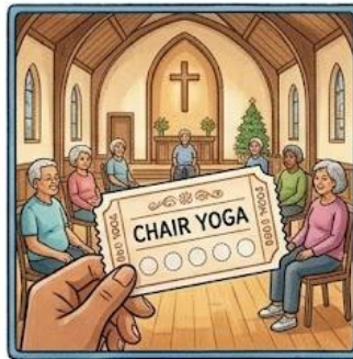
10-Class Pass for Chair Yoga at BUC