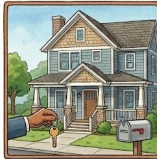
1 week in Petoskey 2-bedroom condo