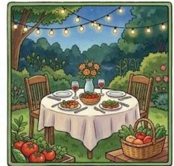
Garden Harvest Dinner