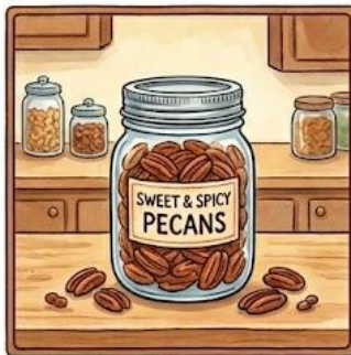
Sweet and Spicy Pecans