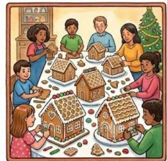
Gingerbread House Party