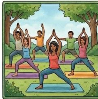
A Group Yoga Session for Your Favorite People