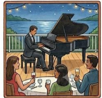
A Jazz Piano Performance for Your Next Party